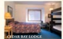
CEDAR BAY LODGE

Hotel-style rooms sleep 5. Fully air-conditioned. Private bath. Chapel with fieldstone fireplace.